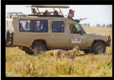
Safari Cruiser with Cheetah