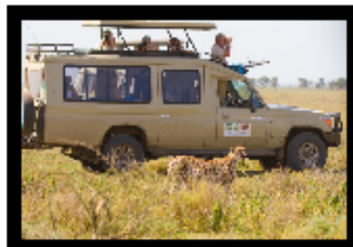
Safari Cruiser with Cheetah